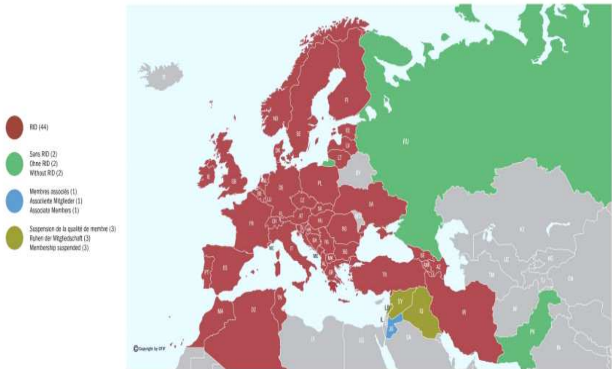
Figure 1 Scope of RID Application [1]

Champ d'application - RID - Appendice C - COTIF Anwendungsbereich des RID - Anhang C zum COTIF Scope of application of RID - Appendix C to the COTIF