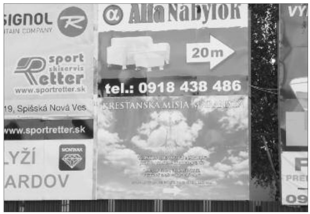
Billboard of Maranata from Spišská Nová Ves, 2014

several national minorities and ethnic groups live in the country. According to the Census of 2011 , Hungarian nationality was claimed by 458,467 (8.5%) citizens, Roma by 105,738 (2%), Ruthenian by 33,482 (0.6%), Czech by 30,367 (0.6%), Ukrainian by 7,430 (0.1%), German by 4,690 (0.1%), Moravian by 3,286 (0.1%), and Polish nationality by 3,084 (0.1%) citizens; less than 1% of citizens claimed Russian (1,997 persons), Bulgarian (1,051), Croatian (1,022), Serbian (698) and Jewish nationality (other: 9,825, i.e. 0.2%, Statistical Office, Census of People, Houses and Inhabitants 2011 ).