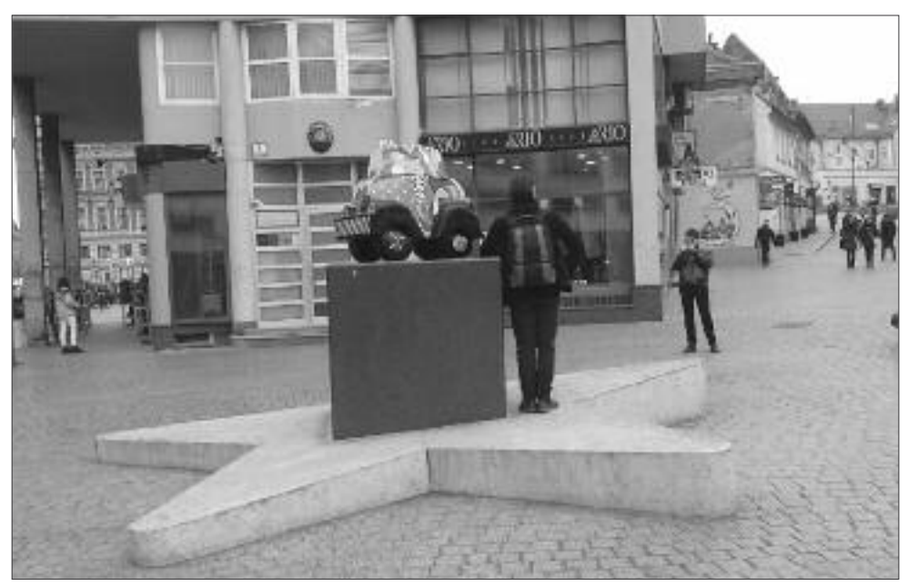
Photo 2: Temporary site-specific intervention (artist: Duje Medić)