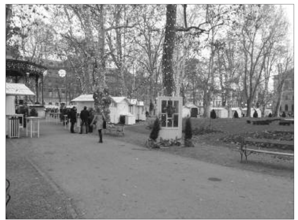
Photo 7: "Advent in Zagreb", park Zrinjevac by day (photo by Valentina Gulin Zrnić, December 2016)

20 locations in the city. ^{14} Another manifestation – Cest is d'Best ^{15} – that celebrates the culture on/of the streets (performers, music) – started initially with only a few days of programme, and in the last year it grew to a ten day festival.