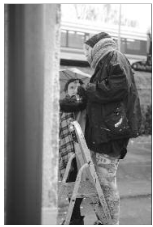
Photo 6: Graffiti artist (OKO) creating art near the railway (photo by Juraj Vuglač, March 2016, courtesy of HDLU)

The artist's view pointed out yet another question as to relationship between the city and art: the means and pace of traversing the city and its relevance for understanding the city. For an urban anthropologist, the dominant pace for encountering the city is mainly the one of pedestrian usually depicted in the figure of the flâneur (Baudlaire,