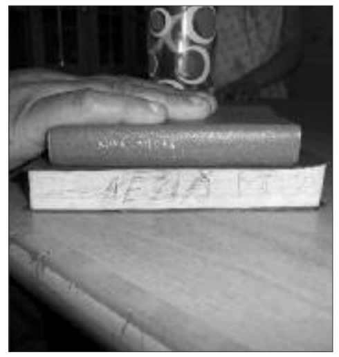
The personal Bible of Roma woman from Rudňany, member of Maranata group. Rudňany, 2014