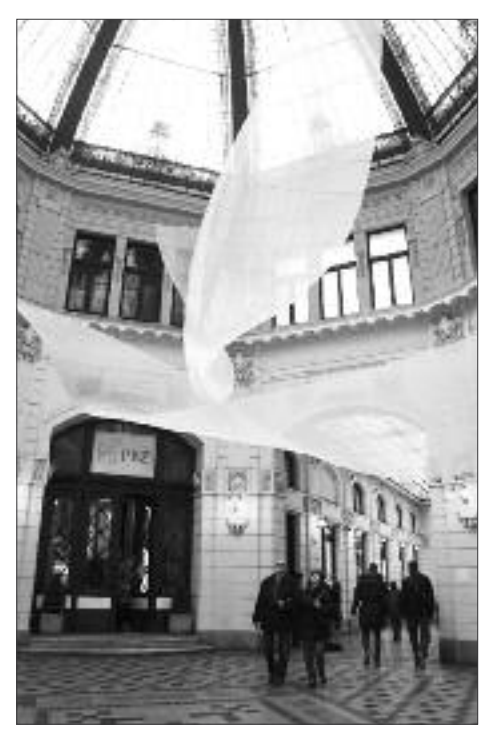
Photo 3, 4: Airy sculpture (artist Ida Blažičko) - aesthetic interruption into a routine passing-by, March 2016

walk through the passage, to add one more artistic dimension (sculptural) to those which already existed in the space – the architectural and musical. Blažičko made an airy sculpture of bamboo and silk, which was hung under the central glass dome. The light made the silk even more ethereal and constant flow of air in the passage made the sculpture to be in slight motion all the time. The name Aithérios for the intervention captured its essence.