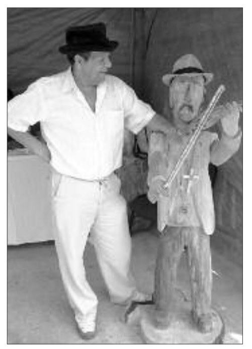
Roma violinist at a gospel music festival Romfest, Čičava 2015