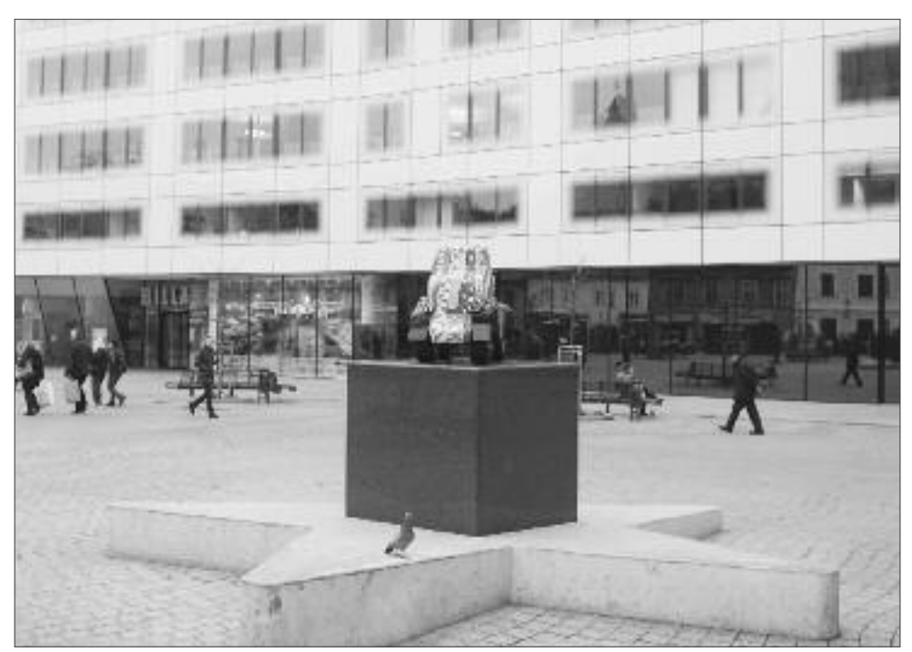
Photo 1: Artistic intervention (artist: Duje Medić) in the contested space (European Square) (photo by Juraj Vuglač, March 2016, courtesy of HDLU)