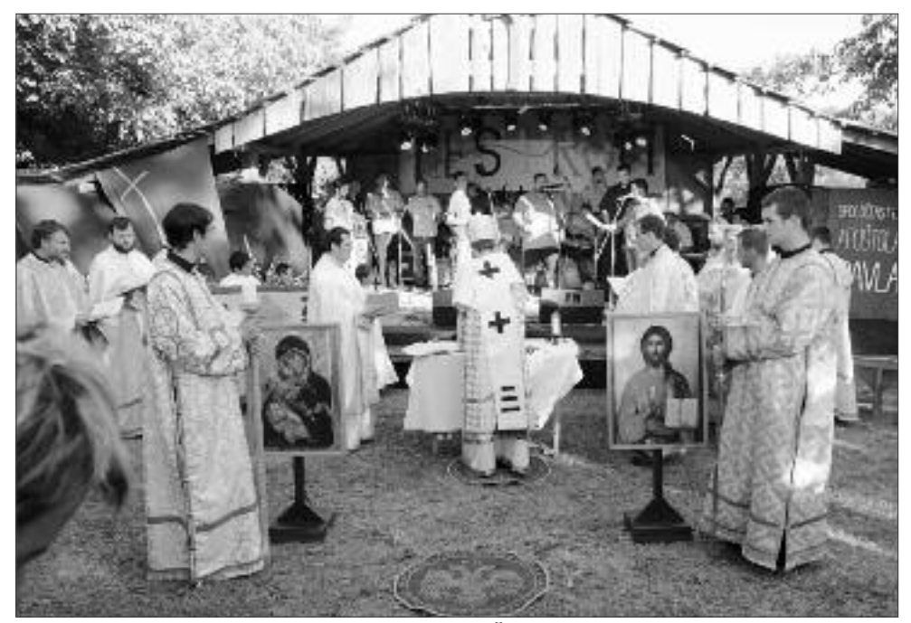
Ecumenic open air Greek-Catholic mass at Romfest, Čičava, 2015

rights of national minorities and ethnic groups. The concept of the constitutional protection of minorities in Slovakia is based on two principles. The first one is the principle of equality and non-discrimination. It is a general principle that guarantees "fundamental rights and freedoms to everyone regardless of … race, colour of skin, language, nationality or ethnic origin…" (Article 12).<sup>2</sup>