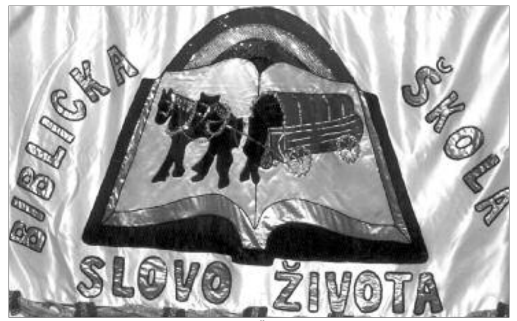
Flag of Biblical School of Word of Life, Plavecký Štvrtok, 2003

If this criterion is tied to primary and secondary networks, it is evident that strong ties prevail in primary networks, and weak ties are rather typical for secondary networks. Within the present mainstream population, the offer of a package with secondary networks is much bigger than that of a package with primary networks. On the contrary, the majority of functional social networks in socially excluded Roma communities have the character of closed primary networks with prevailing strong ties. Such social networks are an ideal space for acquiring an important feeling of personal security. In this space, however, an individual has minimum possibilities to obtain new resources, which significantly determines their social mobility and flexibility from the point of view of social inclusion of the socially excluded.