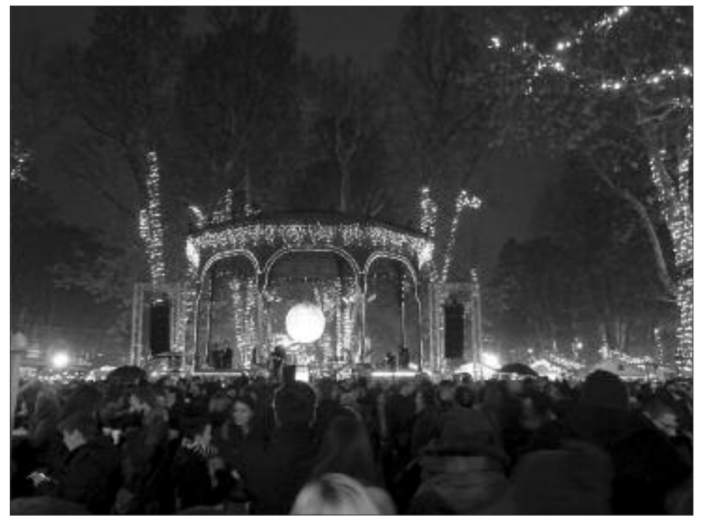
Photo 8: "Advent in Zagreb", park Zrinjevac by nigt (photo by Valentina Gulin Zrnić, December 2016)

January and it was visited by more than 70 000 tourists. <sup>16</sup> It would appear that there is hardly anyone of locals, citizens of Zagreb, who did not "go on Advent" during December. It is the 6<sup>th</sup> season of the manifestation and for the last two years it was selected as the "European Best Christmas Market". <sup>17</sup> The programme is organized in public spaces – parks, squares, streets – of the Downtown, Old Town, and this year in newer part of the city for the first time. Moreover, there are also some public institutions incorporated into the manifestation offering thematic Christmas programmes (museums, ZOO), as well as some private sites (common yards etc.). Almost 30 sites which are occupied by "Advent" manifestation indicate the intention of the organizer to spread all over the city.