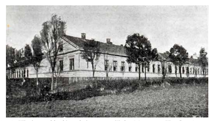
Fig. 3: The hospital buildings before 1918

thus confirming the noble title of baron. Stummer would later provide financial support to the hospital for the maintenance of its buildings, which were prone to damp.<sup>11</sup>