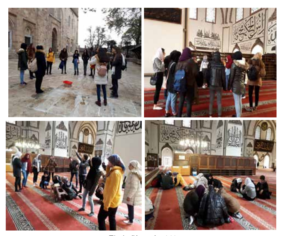
Fig 1. Photos of activities