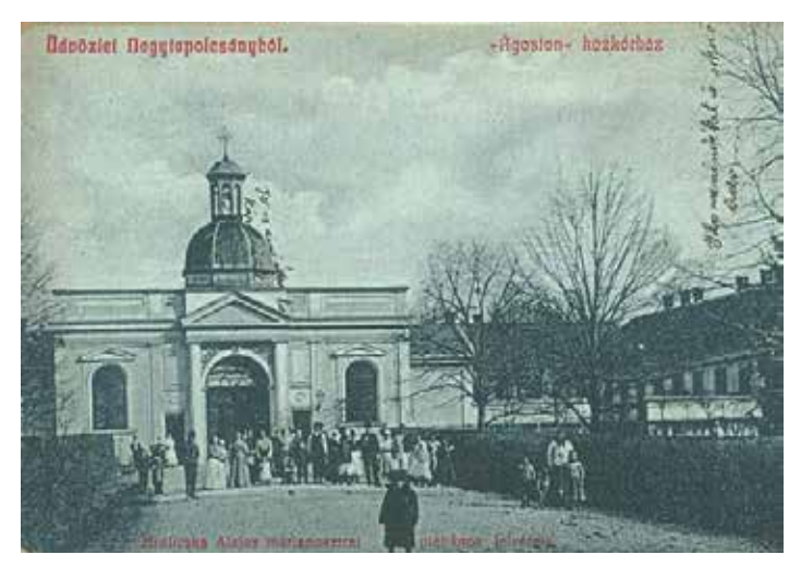
Fig. 2: The hospital chapel and buildings in a 1913 postcard. In the foreground it is possible to see a part of the park between the street and the entrance to the site (Postcard – segment – Tribeč Museum in Topolčany).

fathoms (around 5,250 m<sup>2</sup>).<sup>6</sup> All four structures were registered under number 282, and the owner was given as the county of Nitra.