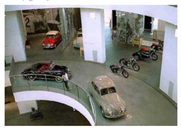
Fig. 2: Design of the exhibition space of the Audi Museum.

use an enlarged scale, and as a result the environment displayed in the photograph below does not have a passive background, and each image chosen is of equal significance to the exhibit presented in front of it (Figure 2).