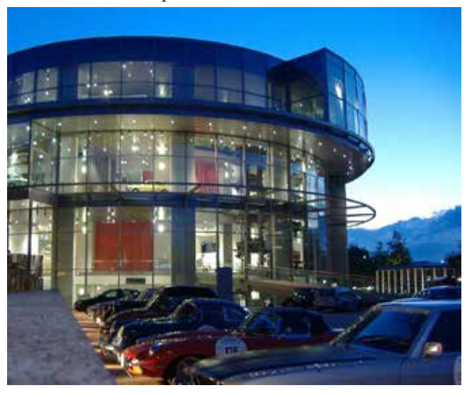
Fig. 1: Audi Museum building in Ingolstadt (Germany). Author: Brian Clontarf—own work Original text: selbst fotografiert, Copyrighted free use https://commons.wikimedia.org/w/index.php?curid=62802224 (accessed Oct 1, 2018)

Outwardly, the Audi Museum resembles a large glass cylinder. The central idea of the museum's exposition—movement and change—has been reflected in its architecture and the design of the exhibition space. The architectural model for the round shape of the building and its internal structure was borrowed from nature. It is based on the trunk of a tree, divided by its annual rings, which are intended to point to the evolution of the brand's technology (Figure 1).