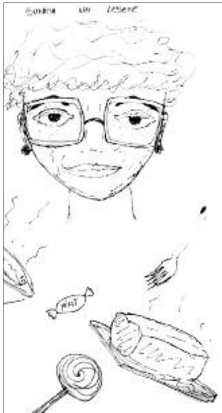
Figure 3. Visual representations of old age: Stereotypical activities

Though statistically negligible, there were several pictures depicting men performing retirement-specific activities, such as walking in parks or large outdoor spaces. Several of the women were depicted doing grocery shopping or carrying utility-type bags (such as shopping bags, returning from the market - 13%) or in the presence of food (8%), suggesting both a nurturing side to the old women in the drawings, and a gender-specific stereotype (Figure 3). In contrast, several of the older men were drawn as smoking or drinking (5%). Only three drawings showed older adults with other people (in two of the cases, with a life partner, and once with a grandchild). There were also two drawings that showed older adults with pets - an old man walking a dog, and an old woman with a cat. The fact that the older people were, in 93% of the drawings, depicted alone, could also be indicative of the stereotype of older adults as lonely and having a reduced social network. Though not prevalent and not statistically significant, several titles mentioned loneliness or difficulties; one drawing depicted an old man visiting a loved one's grave.