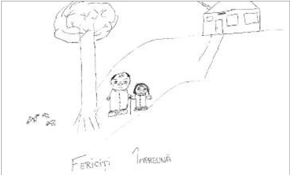
Figure 1. Visual representations of old age: old couple

There are only two drawings in which older adult couples are depicted, and in both cases the women are smaller than the men, by an average of 4.5 centimetres (Figure 1). Previous studies that have employed a drawing-based analysis have discussed the relevance of the sizes of drawn characters (see Falchikov, 1990), where figures depicted as more important are drawn bigger than others.