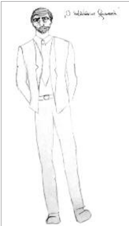
Figure 4. Visual representations of old age: Successful ageing

Positive representations of old age emerged from the drawings. Old age was pictured through positive stereotypes like kindness and being nurturing, and through elements of successful ageing. Still, some gender differences arise. Only women were represented through the idea of kindness and being nurturing, as they were pictured buying, possessing, or offering food (8%). In this case, the old age stereotype is coupled with the gender stereotype. The gender role is also visible when looking at the tendency to assign a grandparent role to the drawn person: 23 of the titles mentioned grandmothers and only 6 of them mentioned grandfathers.